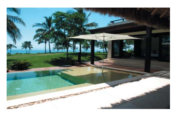
Visit us online at www.villasdeoro.com Villas de Oro Copywright © 2005 All Rights Reserved